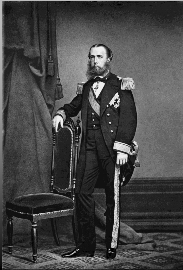
maximiliano de habsburgo